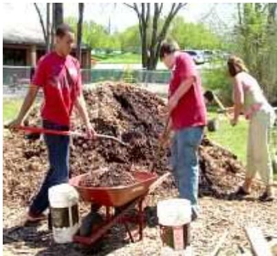
Global Youth Service Day at Columbus Torah Academy.

Department of Health and Human Services.