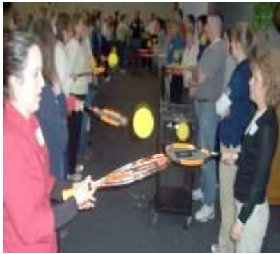
Education and Activity: Let's Get Physical workshop, Maumee.

President Obama is encouraging everyone to participate in the President's Challenge, a six-week fitness challenge that started on May 1st. To log in your activity, and to win small prizes for your effort, visit presidentschallenge.org