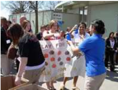
Ohio FCCLA Walk.