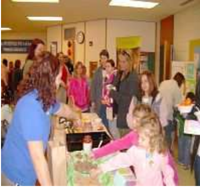
Breakfast at Pointview Elementary.